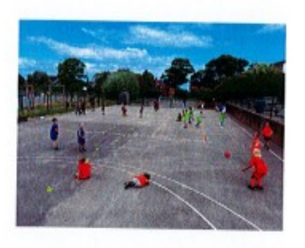
Benchball Basketball Cricket Danish Longball Dodgeball Football Orienteering Rounders Tag Games Tennis

Children will play at least 4 of the following activities every day.